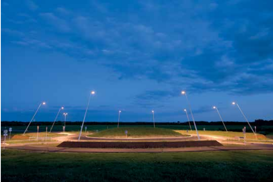
Outside Bramming Preben Skaarup Landskab has designed a roundabout constructed as rings in the water. The precise geometrical shape gives an easily recognizable layout of the construction making it clear to road users that they are nearing a roundabout.

When motorways are designed and constructed, the Danish Road Directorate considers the architectural aspects as technical and functional aspects. This applies to distinctive visual elements as bridges, noise screens, road equipment and when planting. Here, a wildlife crossing at the new motorway, designed by Bystrup.