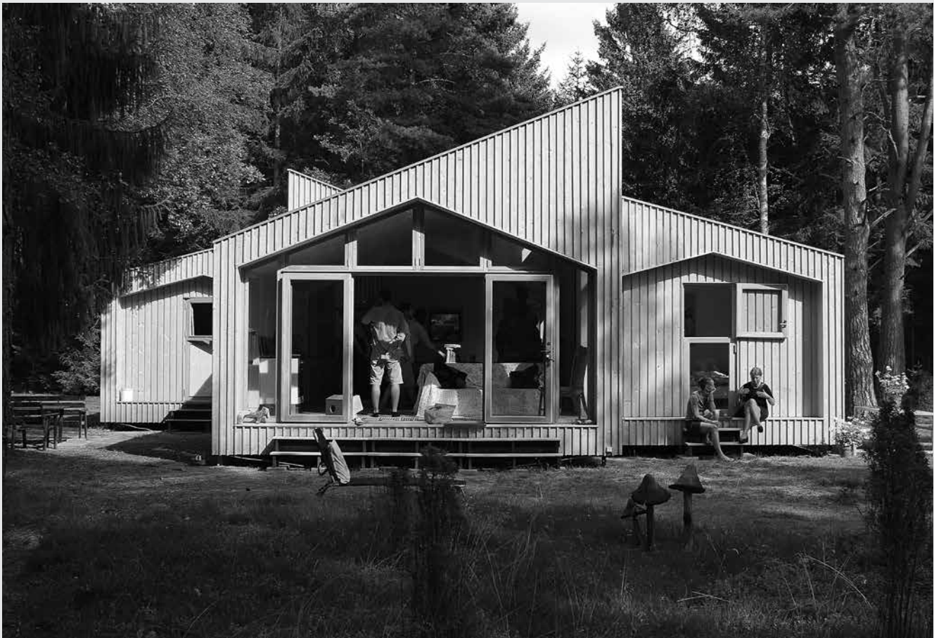
The Summer house in Asserbo is the first house in Denmark produced using the CNC milling technique making it in effect a printed house. The house was designed on a computer and the plans were "printed" on sheets of plywood using a milling machine. The sheets were numbered and subsequently assembled. The house was designed by the architecture company EENTILEEN.