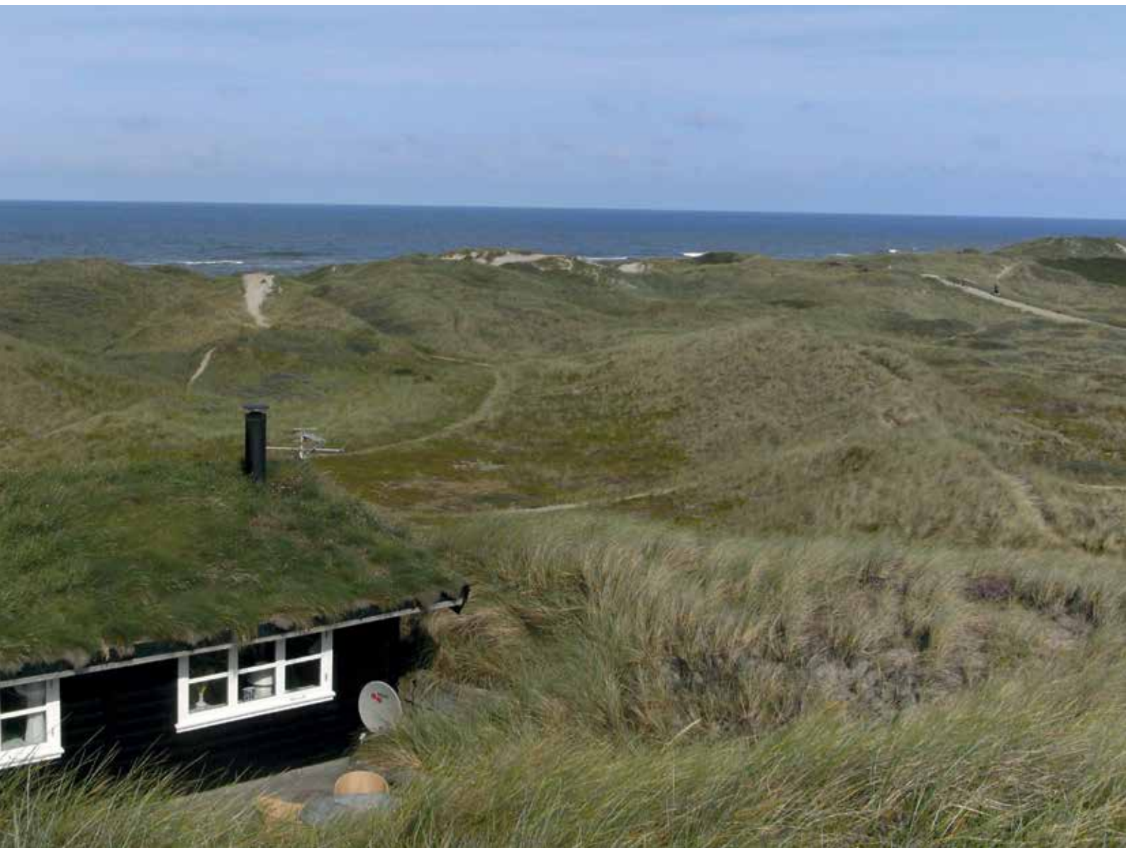
Municipal architectural policy can come in many forms. Ringkøbing-Skjern Municipality has produced a catalogue "Sommerhuse på Klitten – inspiration til bevaring og forbedring". The catalogue describes the landscape at Holmsland Klit and gives an understanding of the quality and the connection between buildings and landscape.