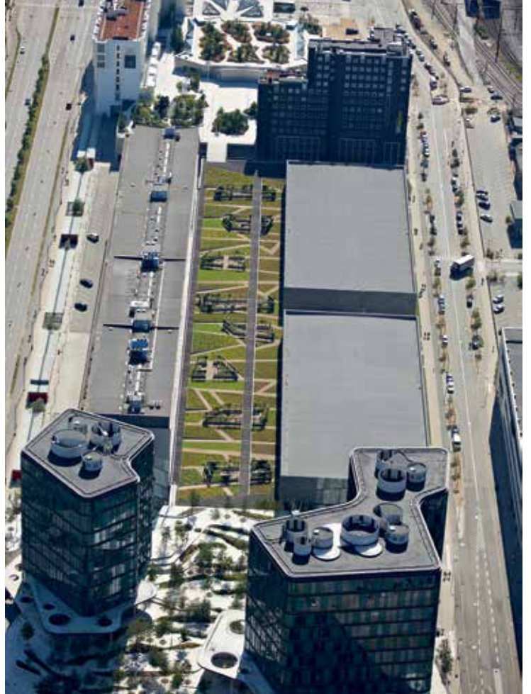
Green roofs act as a meadow and can absorb 60 to 80 percent of annual precipitation. They absorb, evaporate, and delay the rainwater hereby relieving sewers and sewage water treatment plants, ultimately preventing overflow and flooding of streets. Here the green roof of the Danish National Archives designed by Schønherr A/S.