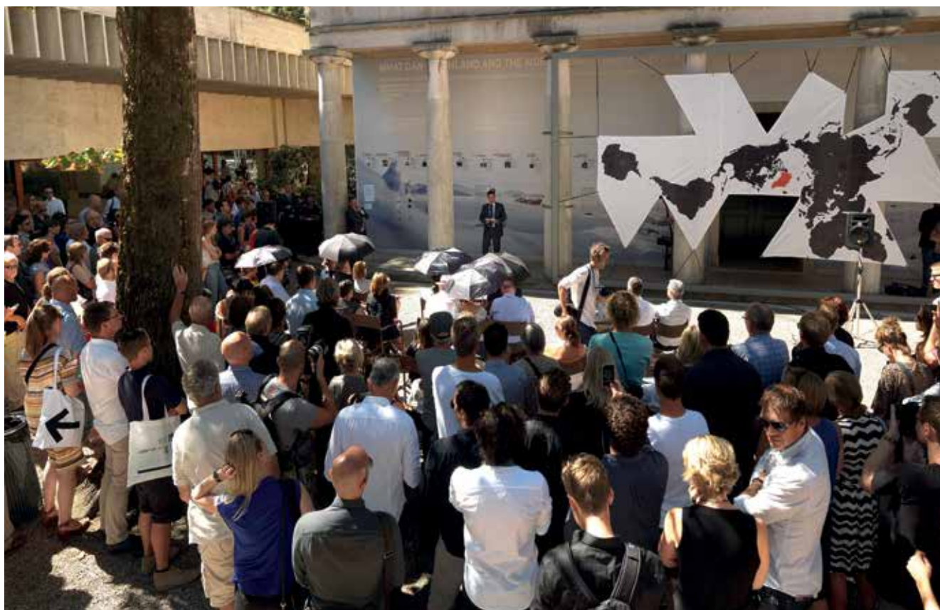
The international Architecture Biennale in Venice takes place every other year. Arsenale houses the main exhibition using different international curators. In the national pavilions the participating countries show their interpretation of the overall theme of the biennale. Here a view from the Danish pavilion in 2012 showing the exhibition "Possible Greenland".

In relation to the tendering of public projects, including the construction sector, the Danish government wishes to introduce regulatory