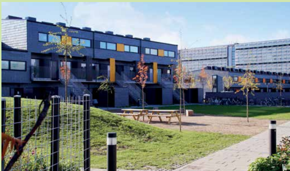
Langhusene in Hvidovre is a part of the Almen Bolig+ concept developed by KAB. The rent in the housing estate is lower than in traditional council housing because residents manage cleaning and maintenance themselves. Langhusene was designed by ONV Arkitekter.

The Ministry of Housing, Urban and Rural Affairs launches an area renewal trial in the Gadehave neighbourhood in Høje Taastrup Municipality, which, in particular, is going to focus on the social sustainability in the area. Thus, the project will create a higher degree of coherence between the urban areas and more security and community in the development of urban spaces. The Gadehave neighbourhood is characterized by social problems and a lack of public spaces and meeting places. The project will focus on creating landmarks, planned urban spaces, and natural meeting places in the public areas.