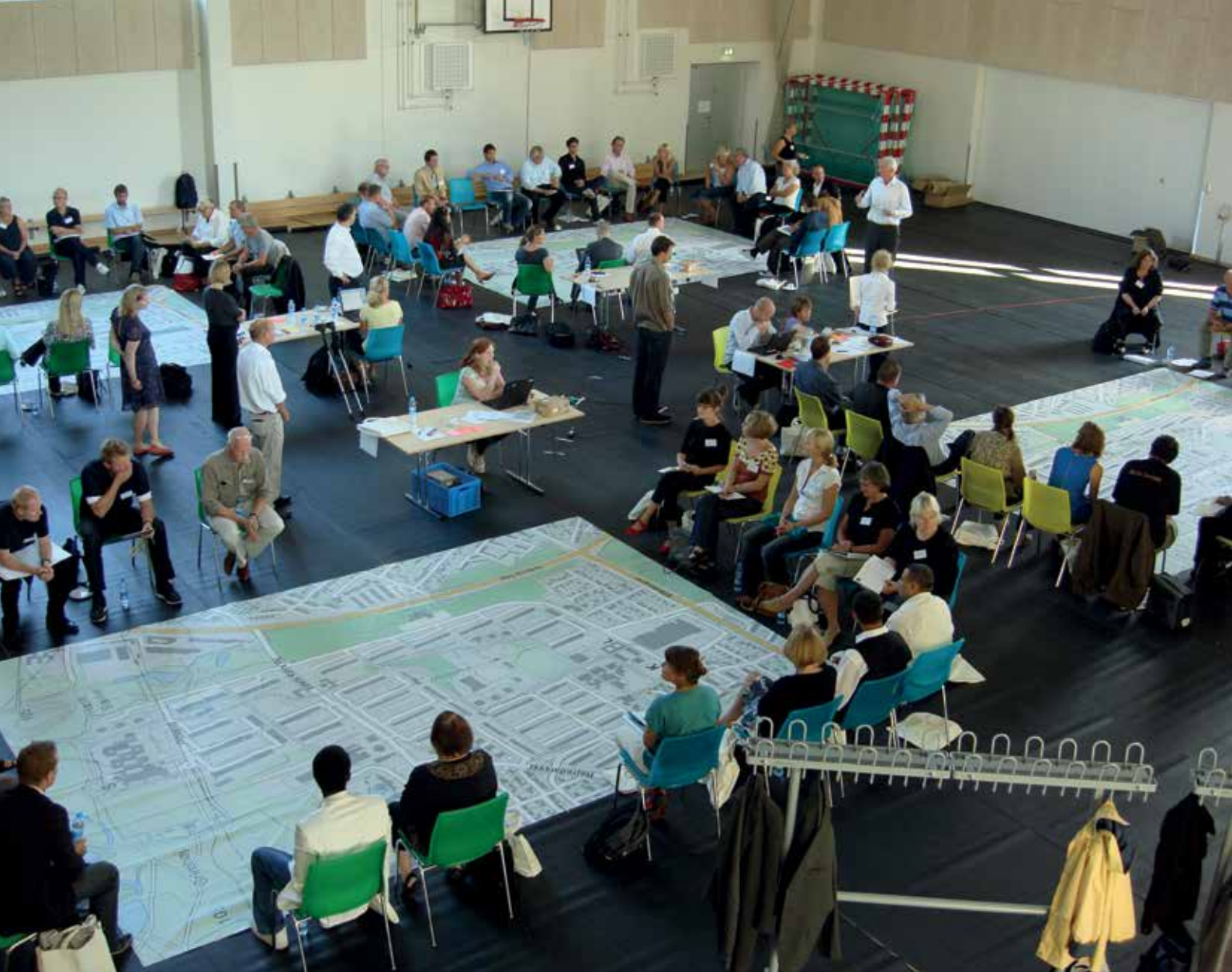
In 2012 Aarhus City Council adopted an architectural policy after an exhaustive public participation process where citizens, stakeholders in the construction industry, and the business community in Aarhus were invited to participate in various events.