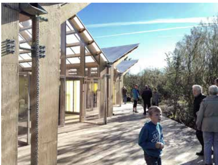
Build it up – citizens in the urban development was a national competition and a TV-programme on how temporary use of urban spaces can create new communities, meeting places and squares. Here, a project in the village of Fjellstervang that now has an outdoor community hall – maybe the first of its kind in the world. Build it up was developed as a cooperation between DR (Danish Broadcasting Corporation) and Danish Architecture Centre in a partnership with Realdania, The Danish Foundation for Culture and Sports Facilities, and the Committee for Architecture at the Danish Arts Foundation. Designed by Spektrum Arkitekter.